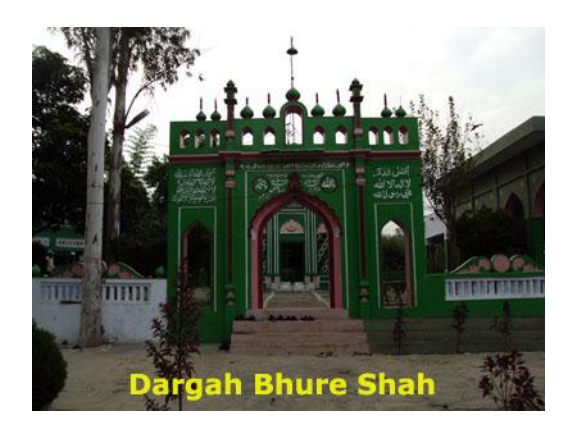
DARGAH BHURE SHAH

GAJRAULA:-It is situated on National Highway no. 24 and 53 Km. away from Moradabad & 100 Km. From Delhi. It has been developed as an important Industrial city. Many large & medium scale industries like Vam Organics, Chaddha Rubber, Shivalik Cellolose of Hindustan Lever etc are situated here.