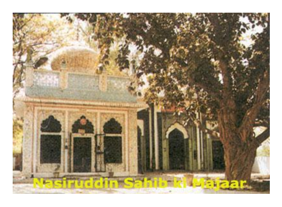
NASIRUDDIN SAHIB KI MAJAAR