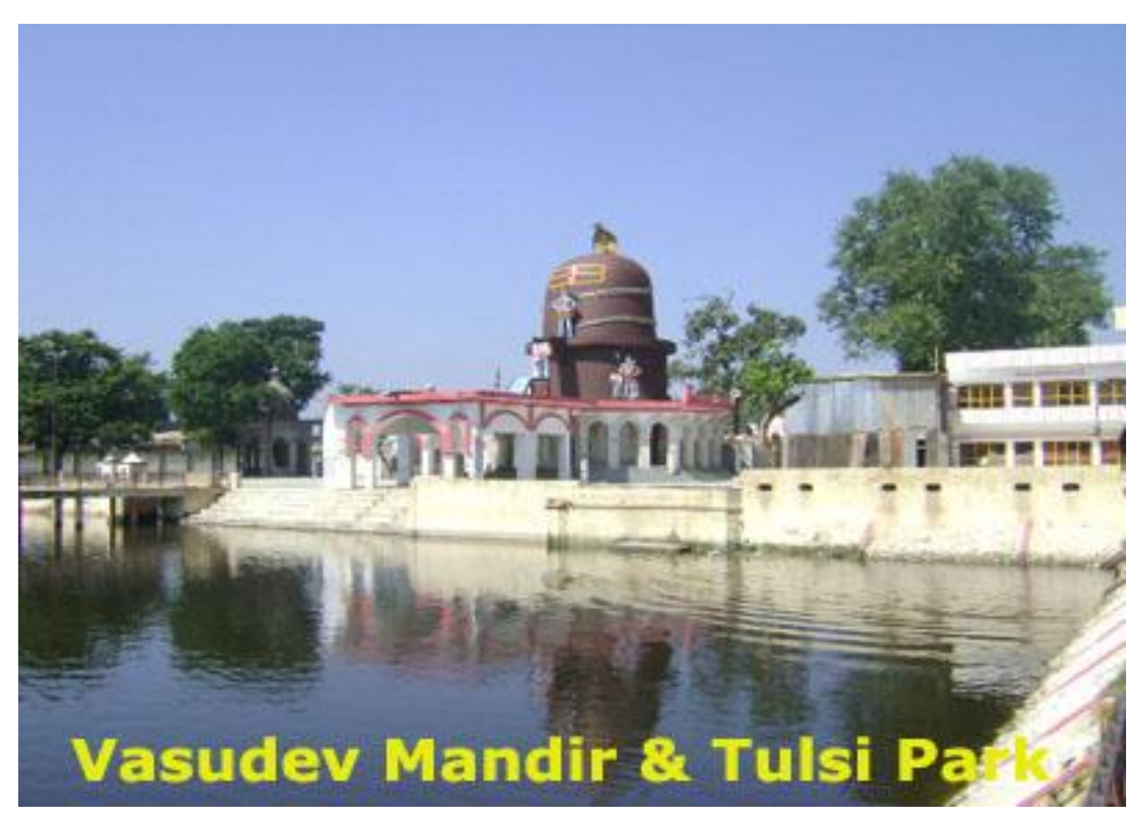
VASUDEV MANDIR & TULSI PARK